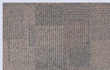
8978 In Motion