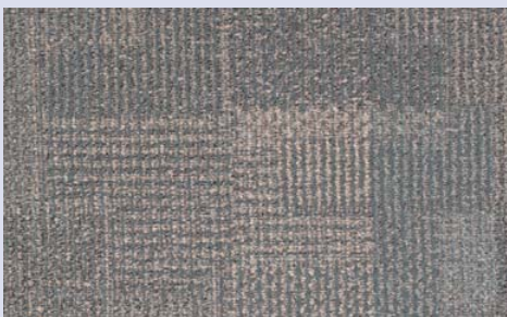
8686 New Idea