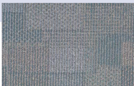
8526 Popular Vote