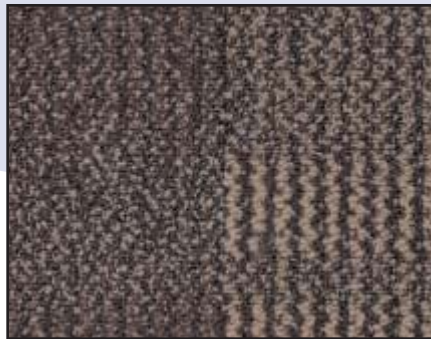
black to business