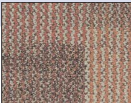
color my world