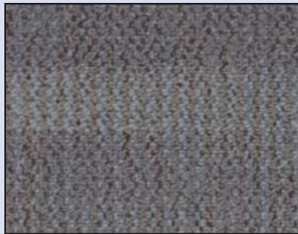
make a splash