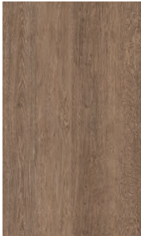
Rustic Limed Wood