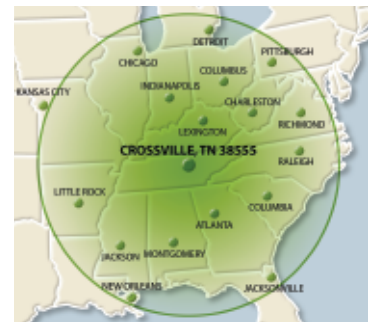
500 mile radius from Crossville facilities