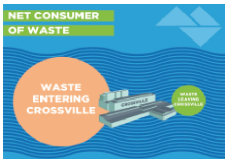
Crossville consumes more waste than it generates