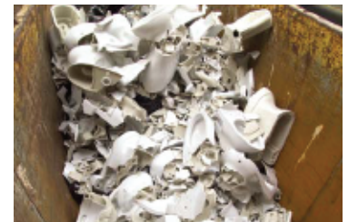
Sanitaryware waste ready to be processed