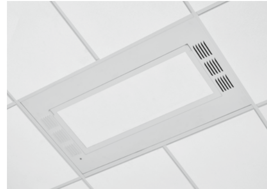
VidaShield UV24 Air Purification System