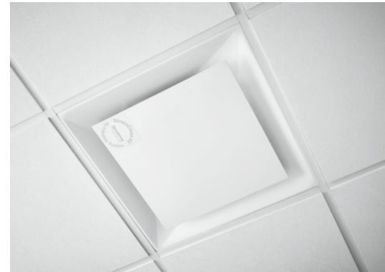
StrataClean IQ Air Filtration System